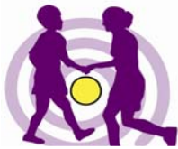
Howard School Sports Partnership

Greenacre School, 157 Walderslade Road, Chatham, Kent ME5 0LP Tel: 07920 599154 Email: solev001@medway.org.uk Website: www.greenacressp.co.uk