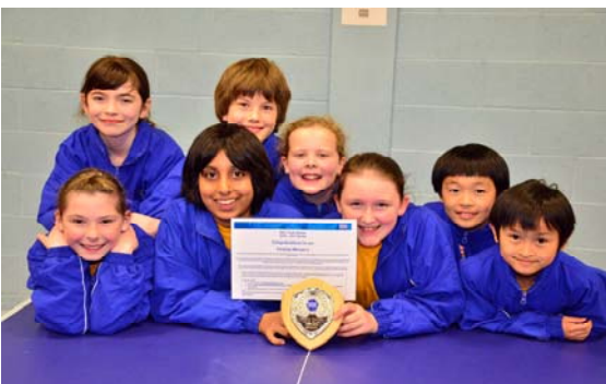
Fair Play Award at Mini Youth Games 2010-11

If the school, after receiving two yellow cards, continues to abuse the Fair Play Charter, they will receive a red card. This means that they will be suspended from participating in the next three MYG events (these can be in different academic years).