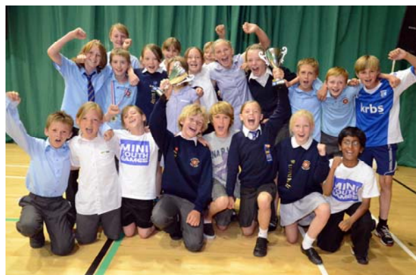
MYG Overall Series Winners 2010-11 St Margaret's Junior School