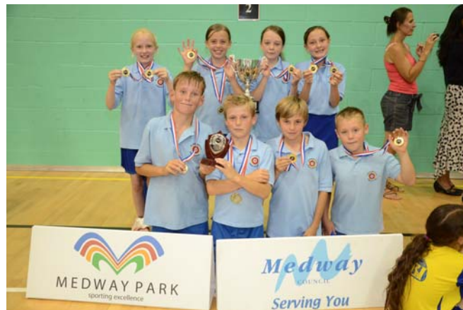
Night of Champions Table Tennis Winners 2010-11 St Margaret's Junior School