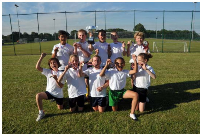
Night of Champions Rugby Winners 2010-11 Wainscott Primary School