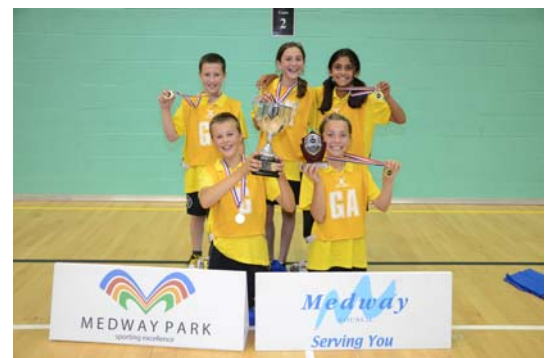
Night of Champions Netball Winners 2010-11 St Augustines of Canterbury