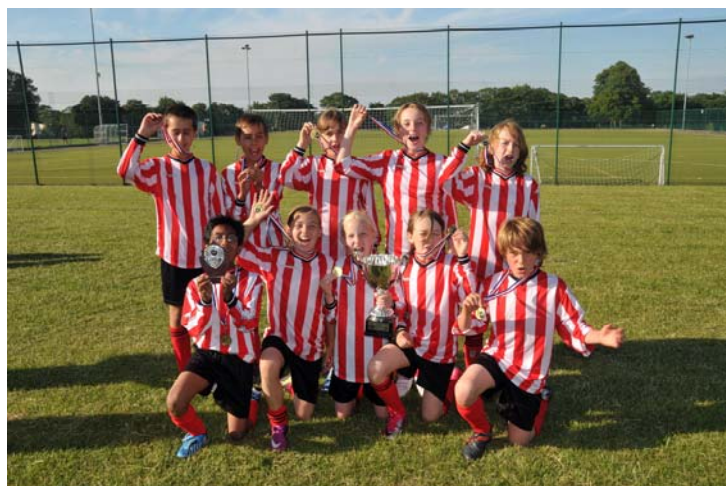
Night of Champions Hockey Winners 2010-11 St Margaret's Junior School