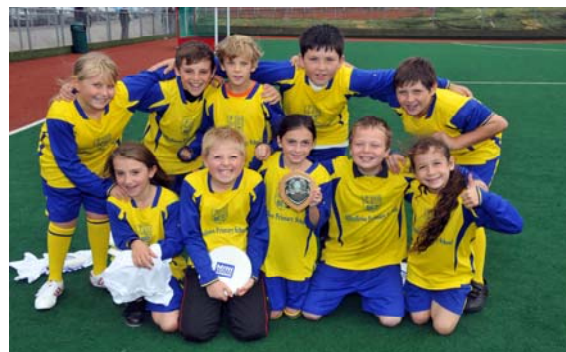
Allhallows Primary Overall Fair Play Champions 2010-11