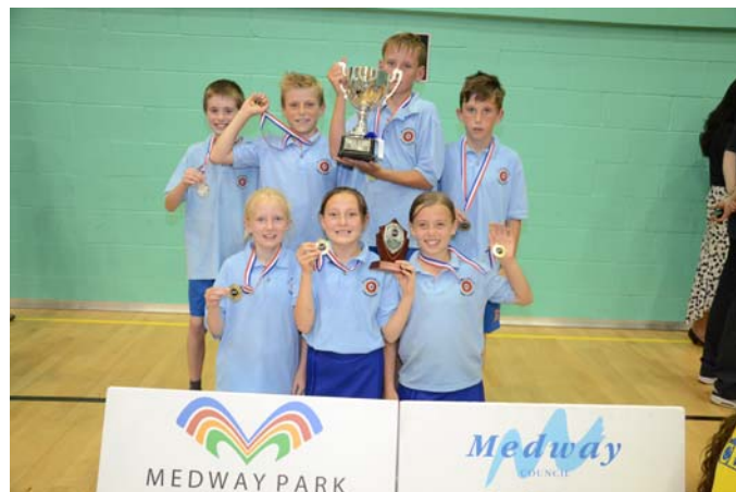
Night of Champions Badminton Winners 2010-11 St Margaret's Junior School